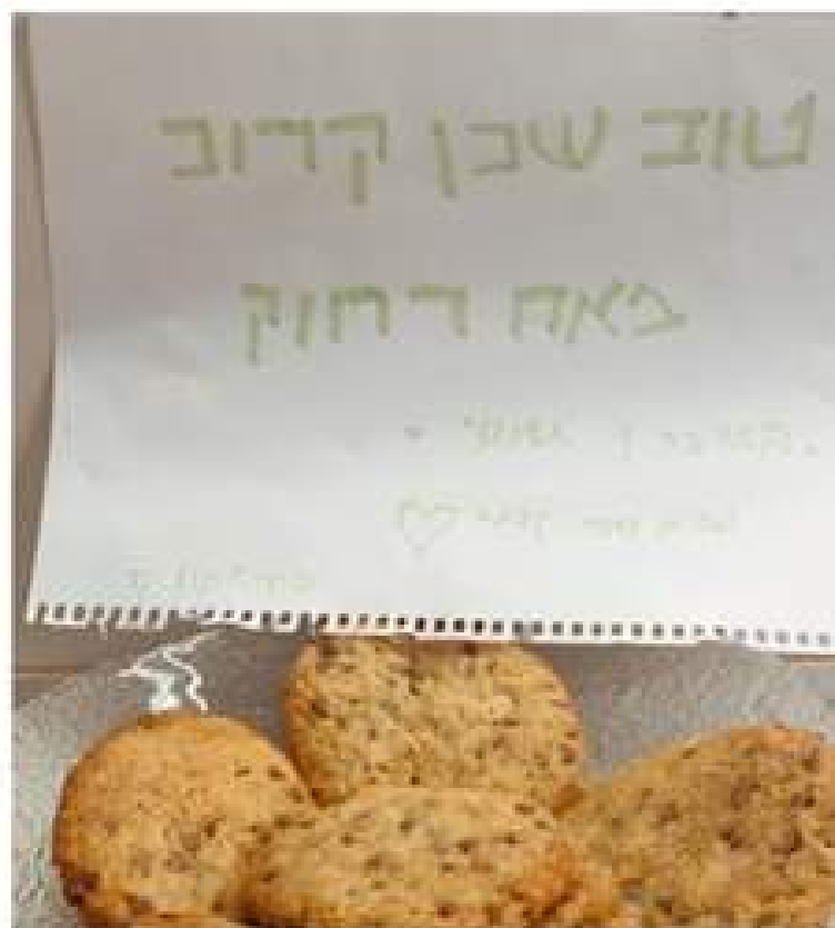
Students adopted the nursing home in the Katamon neighborhood: renovated the garden, planted seedlings, baked cakes, prepared holiday packages for the elderly, came to visit and sang for them.